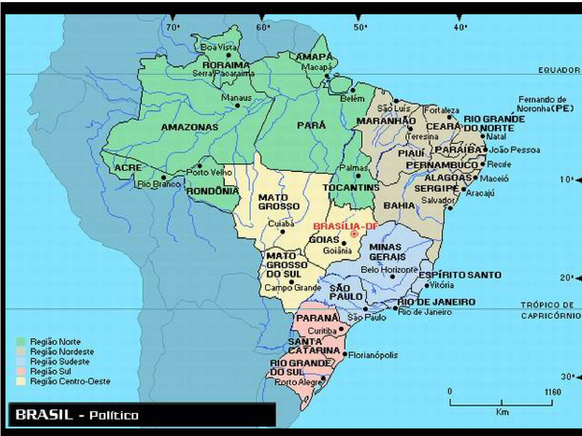
BRASIL - Político