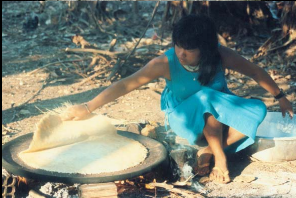
Native Brazilian girls making "beiju", the manioc bread